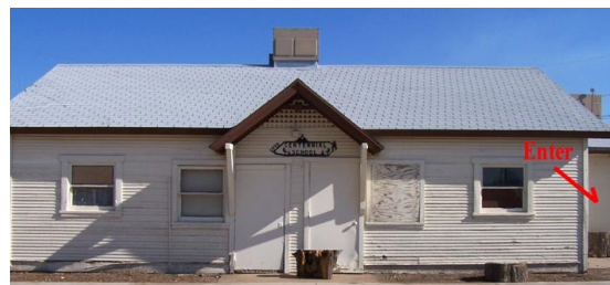
Old Cañon School

The Black Canyon Historical Society (BCHS) will have the Old Cañon School building and a museum at the Park. BCHS's mission is "To collect, advance and disseminate knowledge of the history of Black Canyon and its region: Arizona and the Southwest".