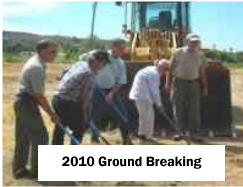
2010 Ground Breaking

Black Canyon Heritage Park (BCHP) and its partners provide visitors, students, and residents of all ages and physical abilities a variety of experiences that instill respect, responsibility, and stewardship for the surrounding area's outstanding cultural, historical, recreation, and environmental offerings.